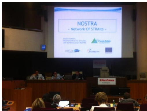
Presentation of NOSTRA project at the national seminar on Interreg Europe in France